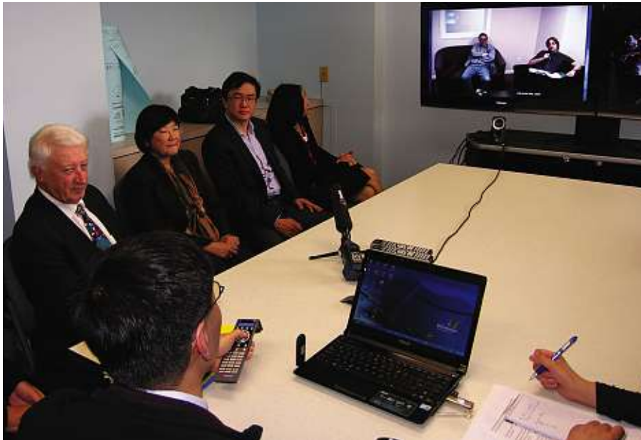
Thanks to the StanJean Foundation, RCH's Psychiatric Department now has innovative technology that brings patients from rural and remote areas right through the doors of RCH without the patient having to leave home.

Innovative technology brings mental health patients to RCH's doorstep without leaving home