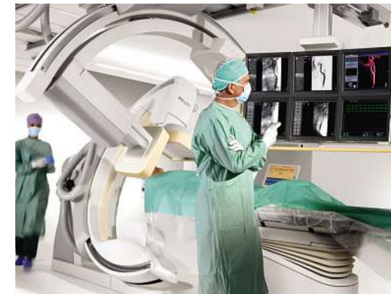
Biplane Angiography Machine with 3D Advanced Mapping System.

The system synchs with other technology such as