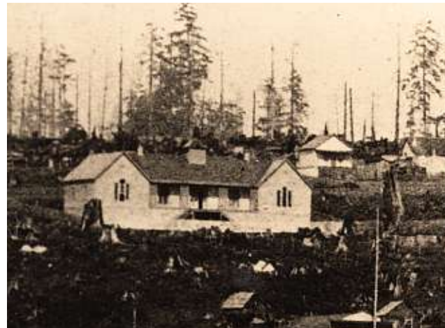
RCH as it looked in 1866, situated along the Fraser River.

Royal Columbian Hospital is celebrating its 150th birthday in 2012. As British Columbia's oldest hospital, it has cared for generations of patients from birth through to passing, and continues to deliver the best in health care today. Be sure to join us in 2012 for events and activities celebrating this monumental milestone in B.C.'s history. Do you have an RCH story you would like to share with us? If so, please contact RCH Foundation at 604.520.4438 or rchfoundation.com .