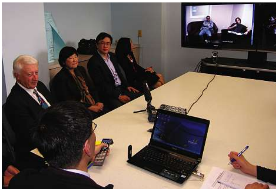
Thanks to the StanJean Foundation, RCH's Psychiatric Department now has innovative technology that brings patients from rural and remote areas right through the doors of RCH without the patient having to leave home.

Innovative technology brings mental health patients to RCH's doorstep without leaving home