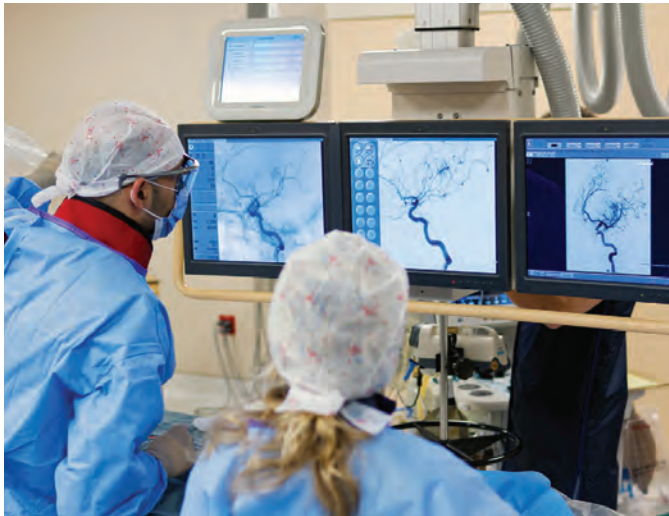
Minimally invasive procedures, such as aneurysm coiling, rely on advanced diagnostic imaging equipment to guide instruments through the patient's blood vessels.

"Having said that, it is a very selective process by which patients are chosen for the coiling procedure," she says. "It depends on their clinical situation and their overall health condition, among other factors."