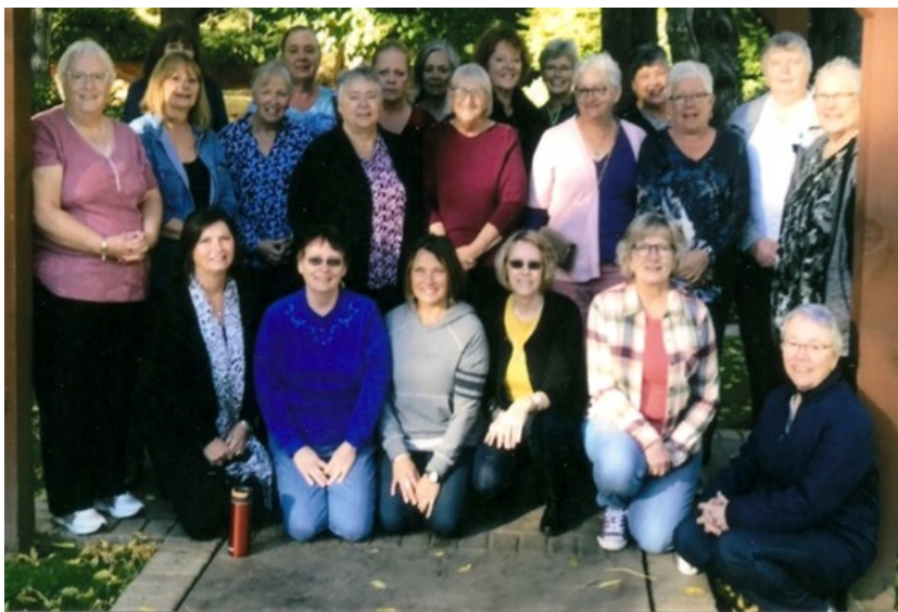
Submitted by Anne Kern

We met over the weekend of October 12 th through the 14 th at Harrison Hot Springs Hotel. We had such a good time. We were all on one floor with a hospitality room too. The floor led directly to the hot tub and the hot pools. Oh boy were they wonderful! Friday night we all met for appetizers and drinks. We had breakfast each day in the hospitality room. Saturday night we had prearranged dinner in the hotel dining room where a band played wonderful music and the dancers danced. The weather was so kind to us – sunshine and light winds. We walked, hiked and hot tubbed. Talked, reminisced and planned – for our 50 th all weekend. Each person had ten minutes to tell about her life both in nursing and out. We even listened to a CD our classmate had made before her death. Throughout the weekend we reconnected, supported and congratulated from each classmate to each classmate. It felt like we were still in training. Goodbyes were said after our group picture was taken outside with some sadness but also joy and the thought of our next reunion.