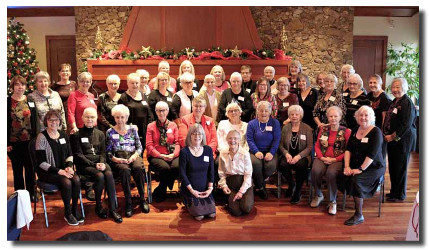
Christmas Luncheon 2023