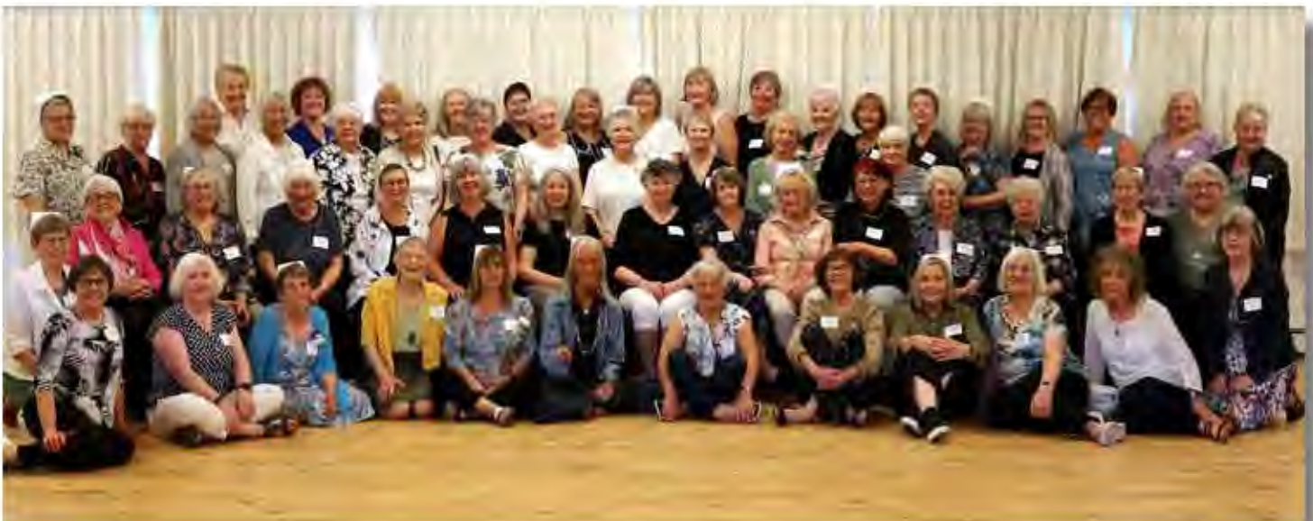
RCH Alumnae, AGM 2025