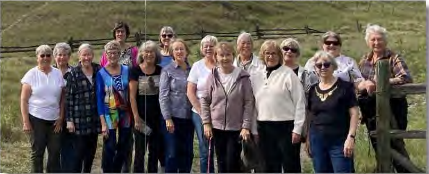
Group picture taken at the Hoodoos in Kamloops.